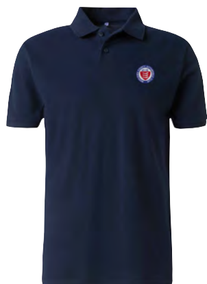
Polo Shirt 50% polyester 50% cotton or Piqué 100% ringspun cotton.