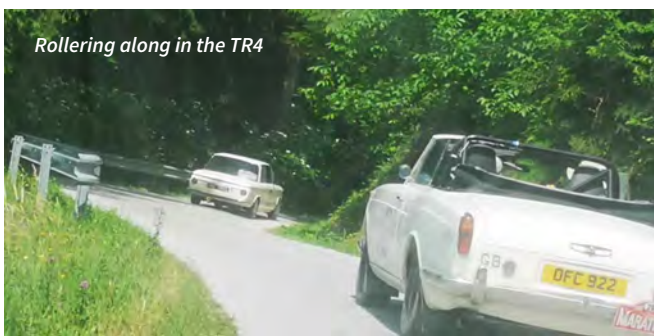
Rollering along in the TR4