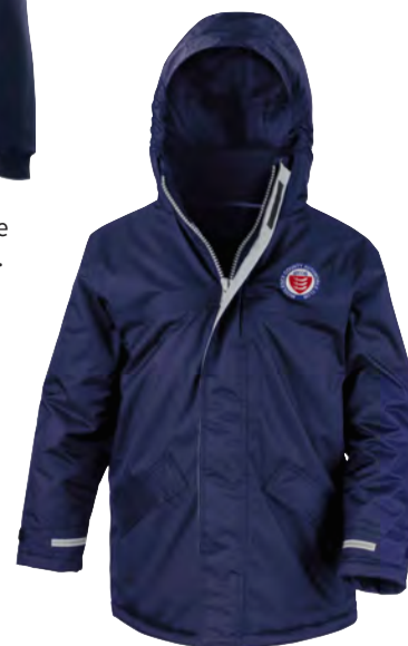
Winter Parka Fully taped waterproof seams. Long fit. Super warm. Quick drying. Fleece lining. Concealed 3-panel hood in collar with adjuster. Full zip. 3 pockets - fronts are fleece lined. Elasticated cuffs with reflective detail. Storm flaps. Lower back reflective tape. Adjustable bottom hem.