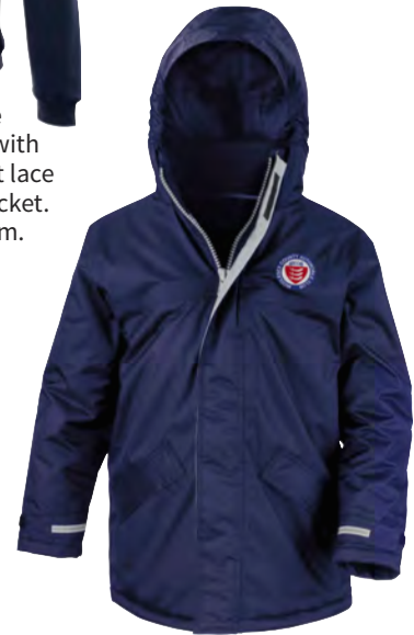
Winter Parka Fully taped waterproof seams. Long fit. Super warm. Quick drying. Fleece lining. Concealed 3-panel hood in collar with adjuster. Full zip. 3 pockets - fronts are fleece lined. Elasticated cuffs with reflective detail. Storm flaps. Lower back reflective tape. Adjustable bottom hem.