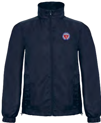
Lightweight Windcheater Midseason windbreaker with tricot thermo lining. Windproof, showerproof. Full zip. Concealed hood. 3 pockets. Elasticated cuffs. Ergonomic side panels. Adjustable bottom hem.