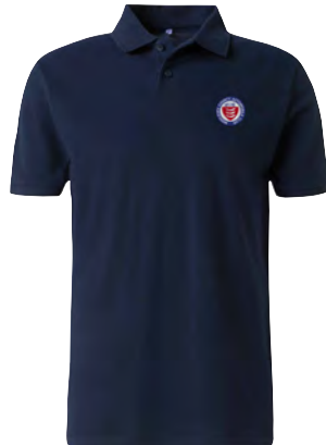
Polo Shirt 50% polyester 50% cotton or Piqué 100% ringspun cotton.