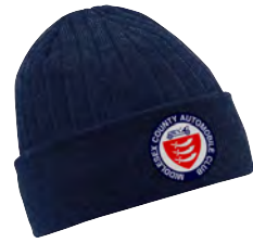
Beanie 100% soft-touch acrylic with Thinsulate™ lining.