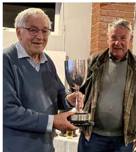
...and is up again to receive the Gamage Cup for the Leading Road Rally Navigator 2022