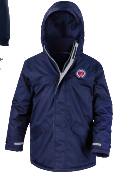
Winter Parka Fully taped waterproof seams. Long fit. Super warm. Quick drying. Fleece lining. Concealed 3-panel hood in collar with adjuster. Full zip. 3 pockets - fronts are fleece lined. Elasticated cuffs with reflective detail. Storm flaps. Lower back reflective tape. Adjustable bottom hem.