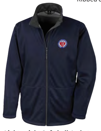
Lightweight Softshell Jacket Full zip. Zip closing front pockets. Chin guard. Micro fleece inner provides extra warmth. Elasticised bound cuff. Slim fashion fit.