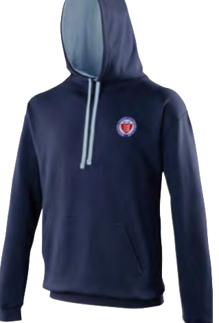
Contrast Hoodie Double fabric hood with contrast inner and flat lace drawcords. Pouch pocket. Ribbed cuff and hem.