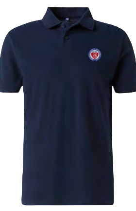
Polo Shirt 50% polyester 50% cotton or Piqué 100% ringspun cotton.