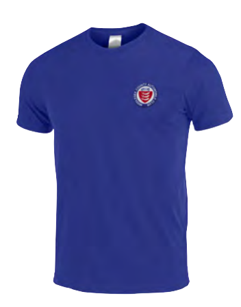
T-Shirt 100% pre-shrunk ringspun cotton.