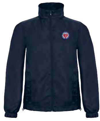
Lightweight Windcheater Midseason windbreaker with tricot thermo lining. Windproof, showerproof. Full zip. Concealed hood. 3 pockets. Elasticated cuffs. Ergonomic side panels. Adjustable bottom hem.