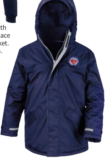
Winter Parka Fully taped waterproof seams. Long fit. Super warm. Quick drying. Fleece lining. Concealed 3 -panel hood in collar with adjuster. Full zip. 3 pockets - fronts are fleece lined. Elasticated cuffs with reflective detail. Storm flaps. Lower back reflective tape. Adjustable bottom hem.