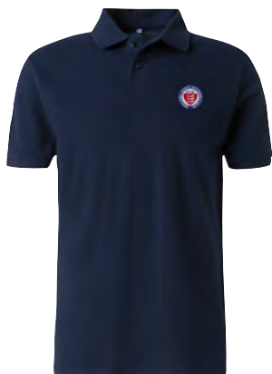
Polo Shirt 50% polyester 50% cotton or Piqué 100% ringspun cotton.