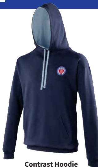
Contrast Hoodie Double fabric hood with contrast inner and flat lace drawcords. Pouch pocket. Ribbed cuff and hem.