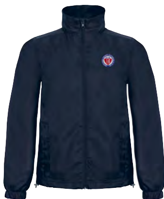
Lightweight Windcheater Midseason windbreaker with tricot thermo lining. Windproof, showerproof. Full zip. Concealed hood. 3 pockets. Elasticated cuffs. Ergonomic side panels. Adjustable bottom hem.