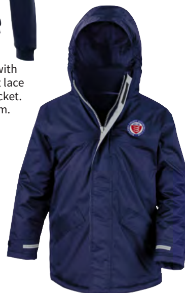
Winter Parka Fully taped waterproof seams. Long fit. Super warm. Quick drying. Fleece lining. Concealed 3-panel hood in collar with adjuster. Full zip. 3 pockets - fronts are fleece lined. Elasticated cuffs with reflective detail. Storm flaps. Lower back reflective tape. Adjustable bottom hem.