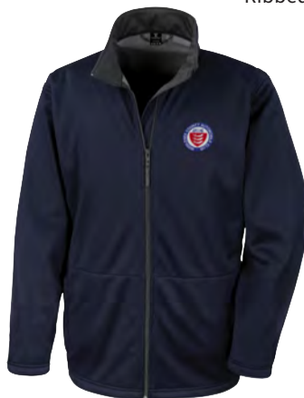
Lightweight Softshell Jacket Full zip. Zip closing front pockets. Chin guard. Micro fleece inner provides extra warmth. Elasticised bound cuff. Slim fashion fit.