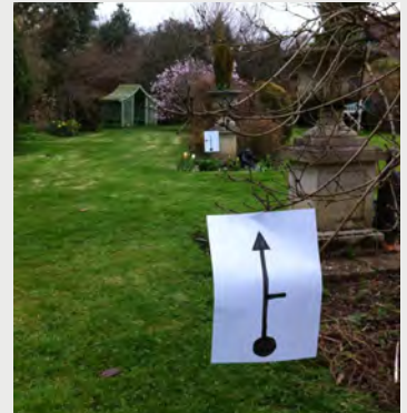
It must be Spring - the tulips are out in the garden again!!