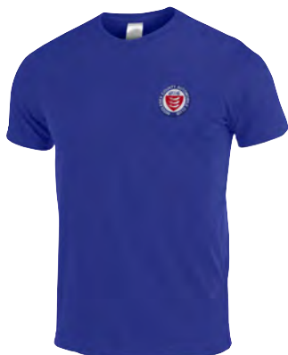
T-Shirt 100% pre-shrunk ringspun cotton.