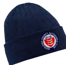
Beanie 100% soft-touch acrylic with Thinsulate™ lining.